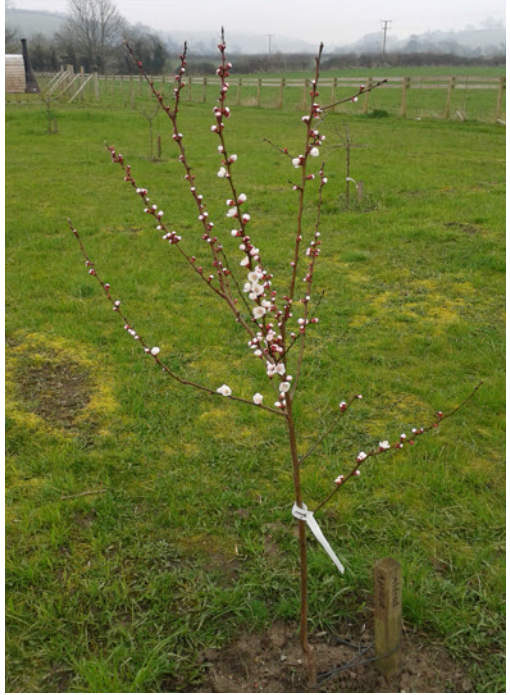
Apricot Goldcot in blossom

spirits rise and the other trees are beginning to show buds breaking. Everything is springing into life after a few days of dry sunny and much warmer weather so it won't be long before everything is green and starting to grow strongly.